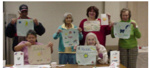
Residents of the Fort Stockton Nursing Center show off their crafts at a recent library visit.

If you are in 6th–12th grade, come to the library and take part in the Young Adult Writers & Artists Club—and you could find your work published in the 2006 YAWA magazine.